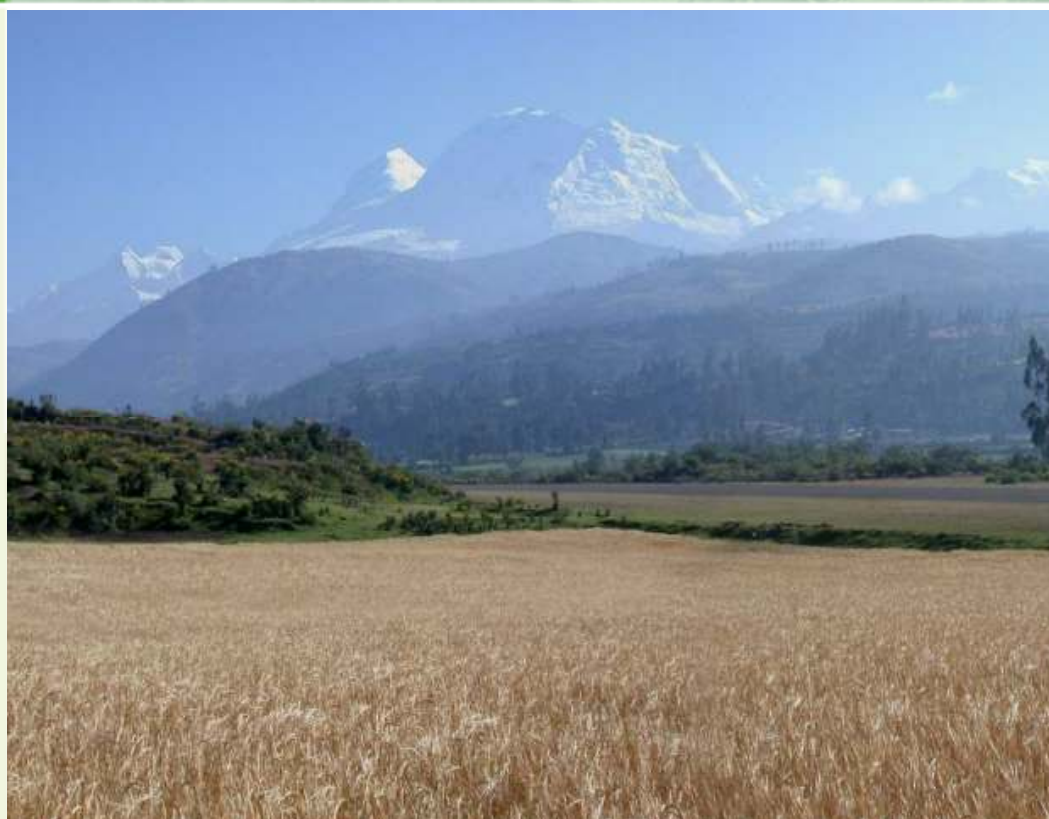
Barley mutant variety, UNA La Molina 95, at 5000 m altitude, Peru (for details please refer to TC Project Highlights).